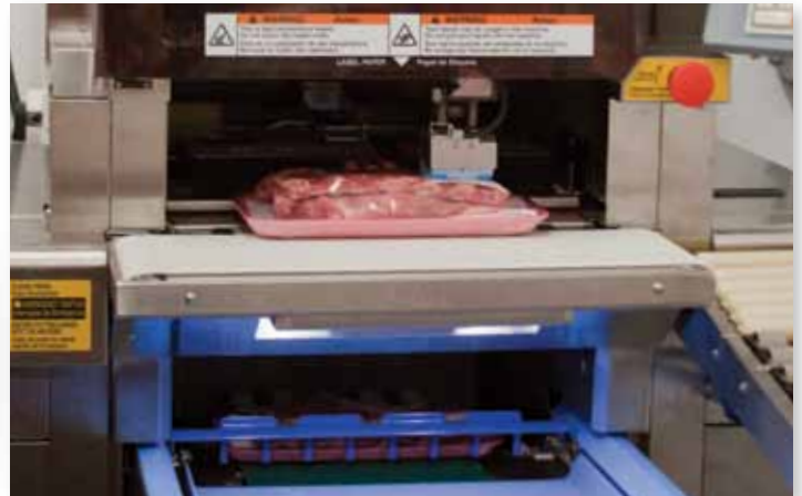
Robotic Label Applicator with User Selectable Positioning

This feature prevents unnecessary impact with the film and commodity so labels will be consistently applied accurately and straight on all products without damaging packaging or contents.