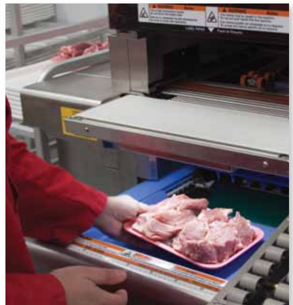
Scale and Tray Detection Area

Difficult and awkwardly positioned product such as stacked or loose items can prove to be a challenge with automatic systems. With the WM-4000, these items can be conveyed at any of three programmable speeds (low, medium, high). This strategic design prevents toppling and spills, keeping production moving.