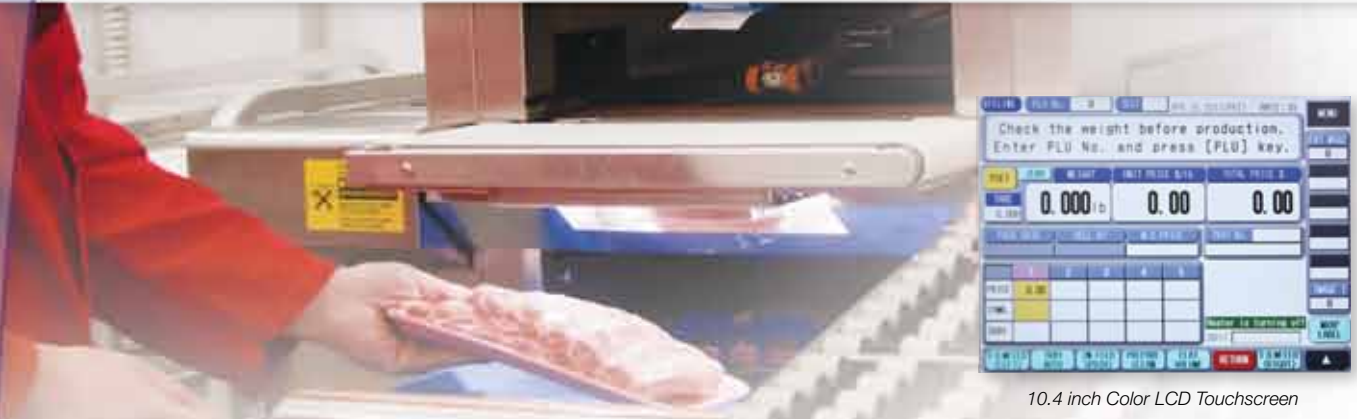
10.4 inch Color LCD Touchscreen

FULLY AUTOMATIC WRAPPER with INTEGRATED SCALE and LABEL PRINTER/APPLICATOR