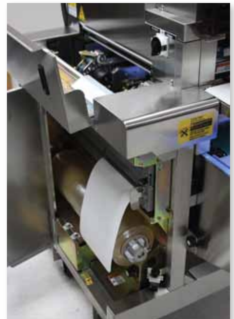
Film Loading Area with Auto Set

Frequent cleaning is easily accomplished with the detachable and washable in-feed tables and lifts. The entire exterior body is crafted from stainless steel providing superior rust-resistance, stringent cleanliness and outstanding durability. Easily sweep and clean under and in front of the unit due to the open interior design and generous underbody clearance below.